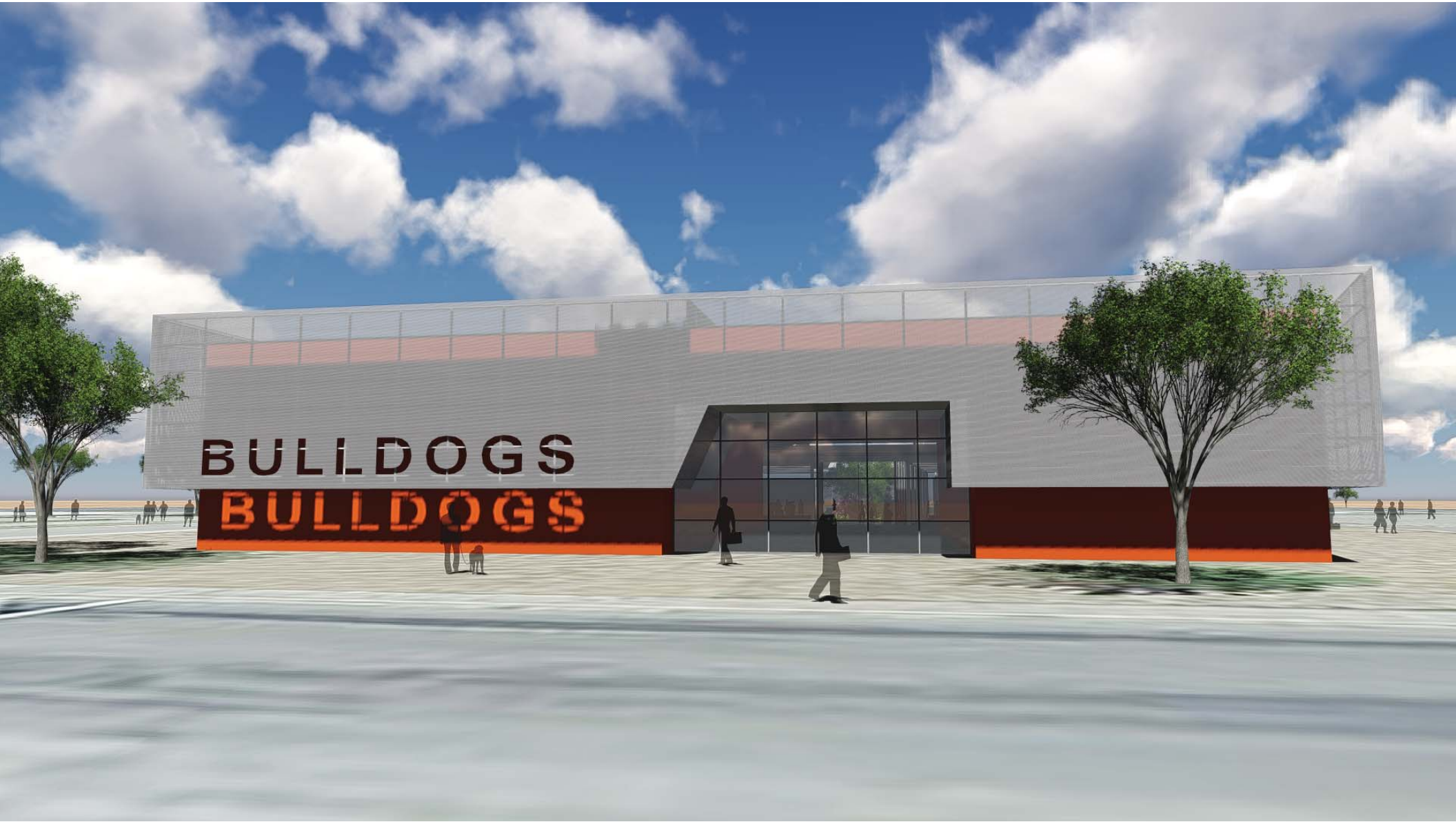
WEST VIEW-TRAINING & BOARD ROOM