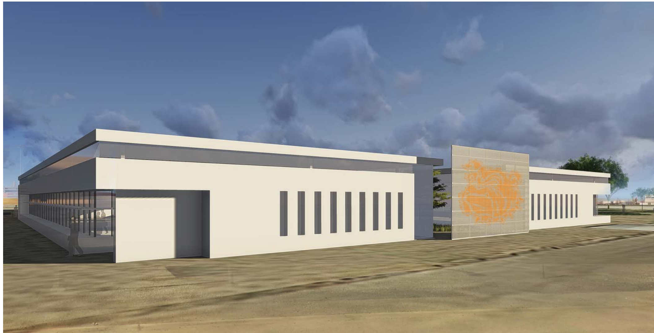
EAST VIEW OF BULLDOG SCREENWALL