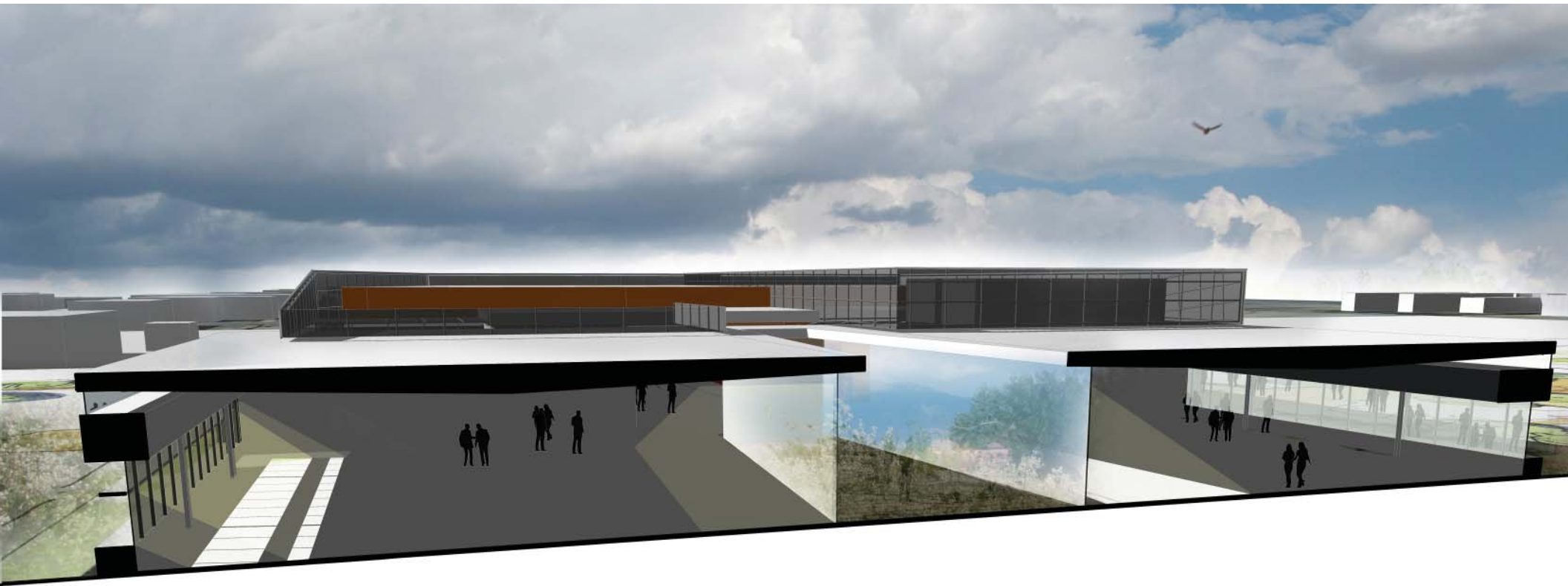
SECTION THROUGH COURTYARD