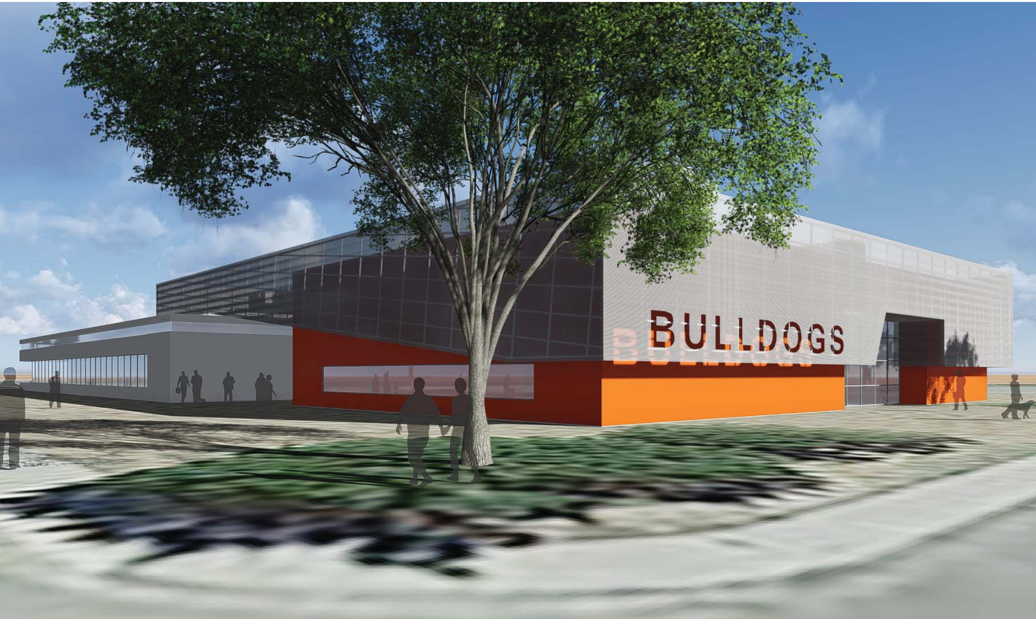
NORTH WEST VIEW