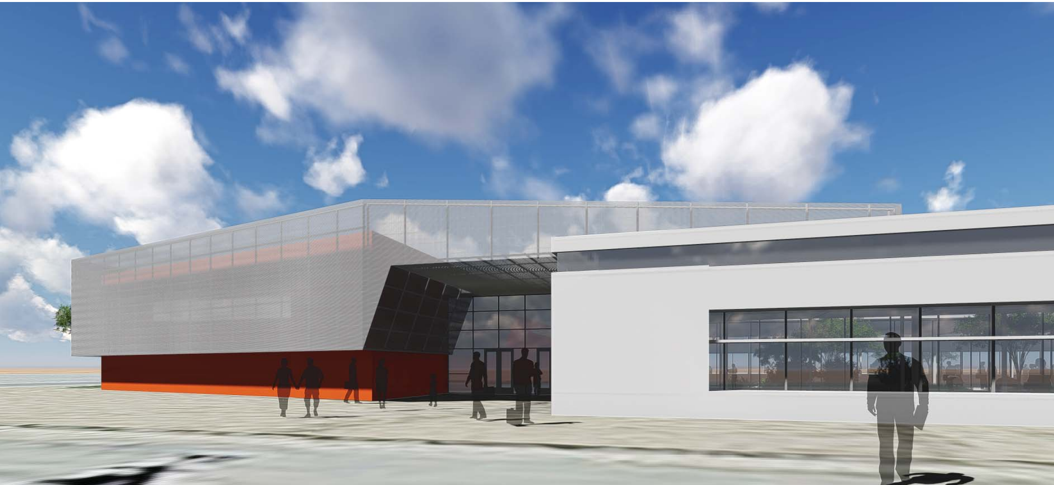
SOUTH ENTRY VIEW